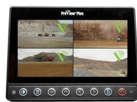
7" PreView Monitor (4 camera setup)