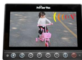
7" PreView Monitor